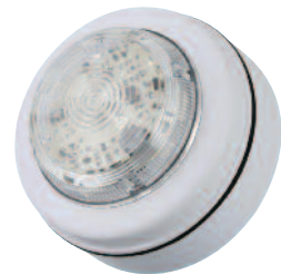
Solista Maxi White