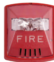
Exceder Horn Strobe Red - Wall